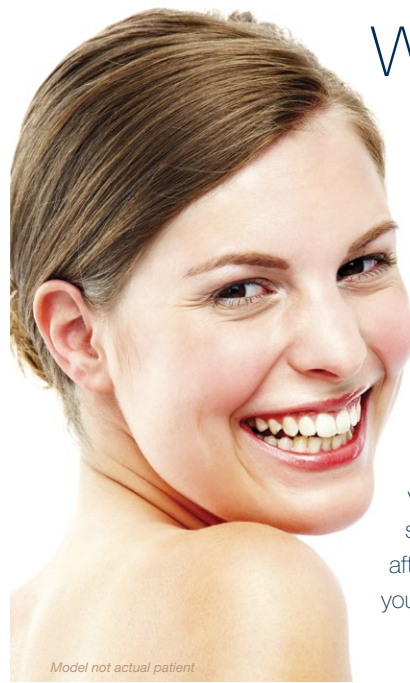
Model not actual patient

Experience minimal downtime in a “lunch-time” treatment and return to your busy lifestyle